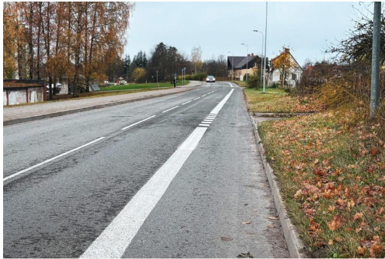
Figure 1. Temporary cycling lanes.