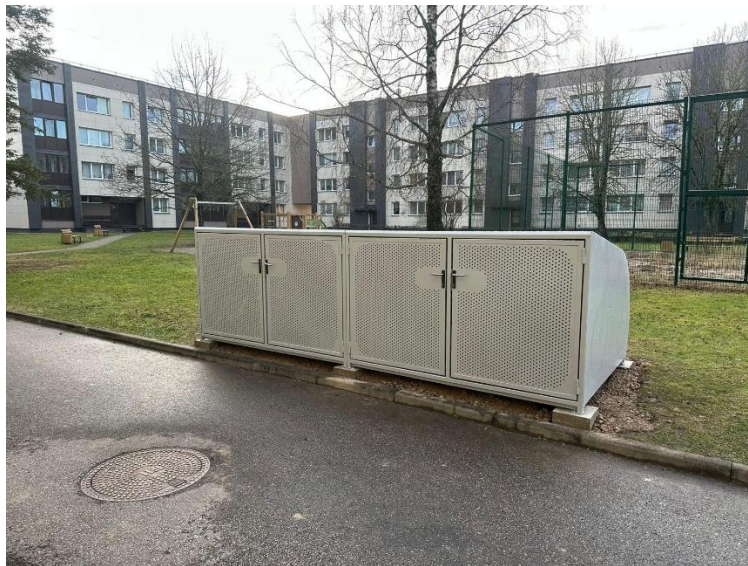
Figure 2. Roofed bicycle sheds.